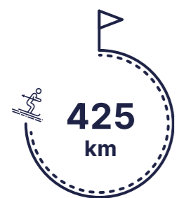
Alpine ski slopes