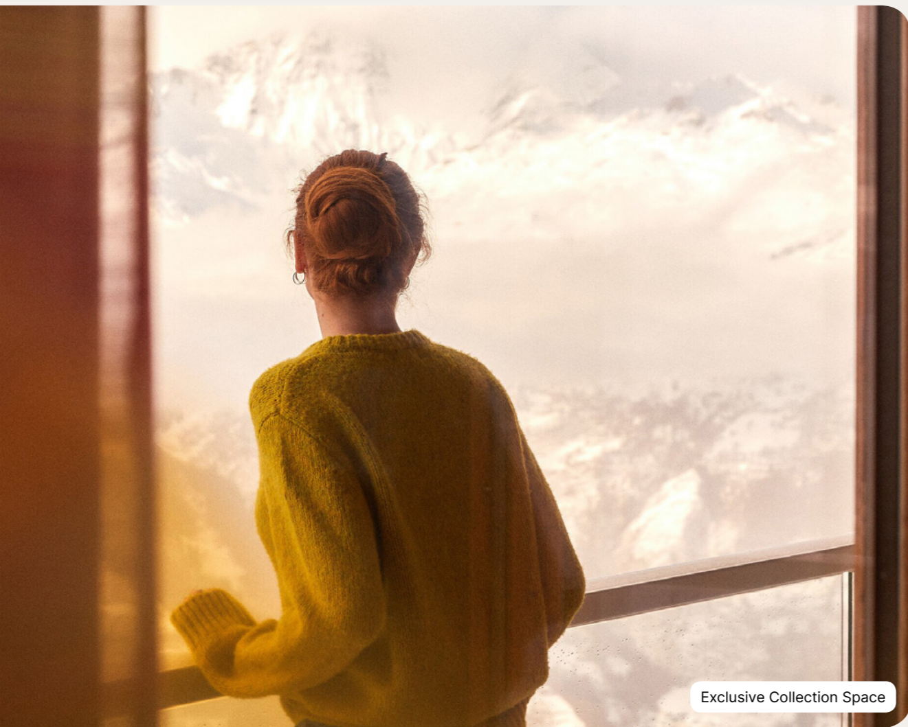
Exclusive Collection Space