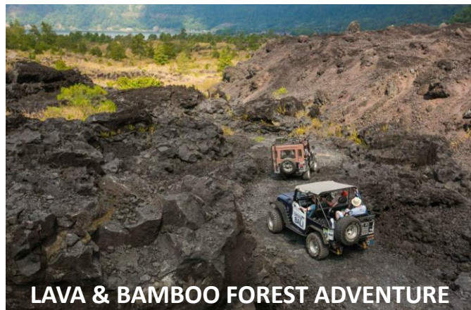
LAVA & BAMBOO FOREST ADVENTURE