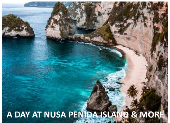
A DAY AT NUSA PENIDA ISLAND & MORE

With the help of passionate guides and thanks to the splendor of its excursions, Club Med offers you a unique and personalized choice of unmissable visits and unforgettable moments with your friends and family.