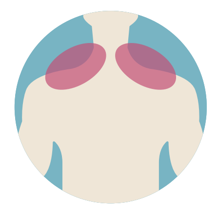
1. Start by placing your hands on the shoulders with the thumbs on the upper back and the four fingers just to the side of the collar bone.