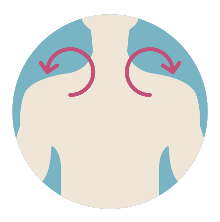
2. Make a circular motion with the entire hand.