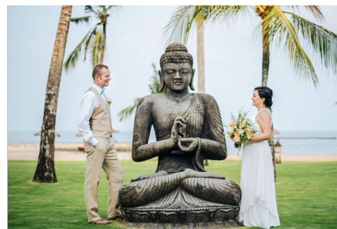
Wedding images courtesy of Wedding planner: THE SEZEN AGENCY