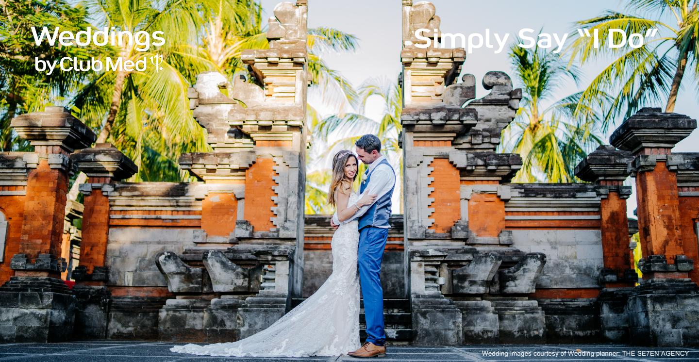
Wedding images courtesy of Wedding planner: THE SE7EN AGENCY