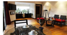
Suite with Seaview

Now - 28 Oct: - 25% off on Land Stay per adult and child aged 4 to 11 (a minimum stay of 4 nights is required)