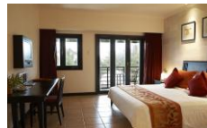
Deluxe Room with Seaview