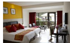
Deluxe Room with Seaview Terrace