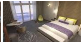
Suite - Bedroom

Book NOW to get the Summer Latest Promotion!