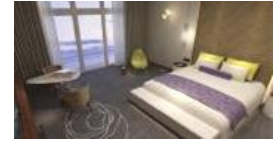
Suite - Bedroom

Book NOW to get the Summer Latest Promotion!