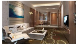
Suite - Living Room