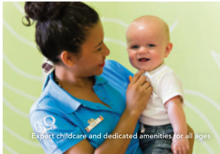
Expert childcare and dedicated amenities for all ages