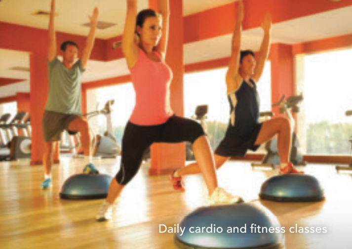
Daily cardio and fitness classes