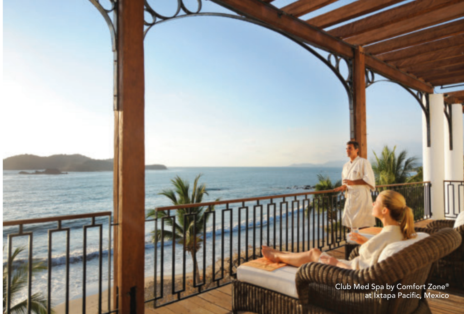
Club Med Spa by Comfort Zone® at Ixtapa Pacific, Mexico