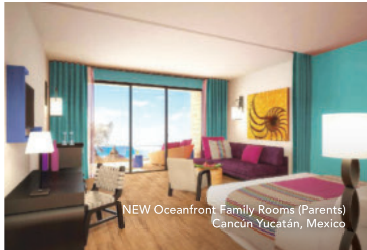
NEW Oceanfront Family Rooms (Parents) Cancún Yucatán, Mexico