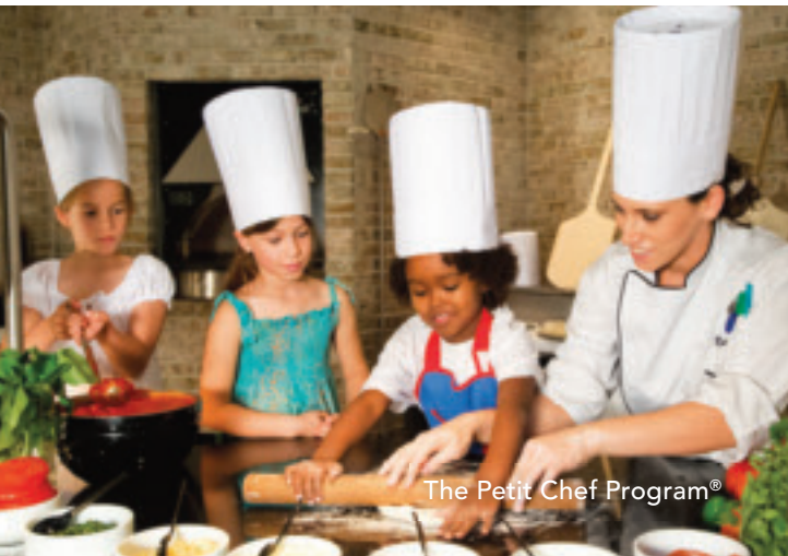
The Petit Chef Program®

At select resorts, there are specialized learning activities, such as Petit Chef®, which teaches kids to cook and about healthy eating, and the Baby Gym, which helps develop motor skills. And now, there's a new CleanArtPlanet Workshop Program, which raises environmental awareness by transforming recycled materials into works of art.