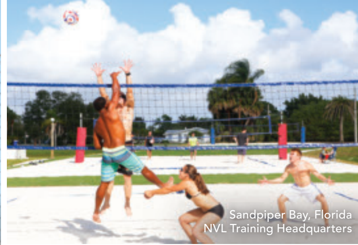
Sandpiper Bay, Florida NVL Training Headquarters