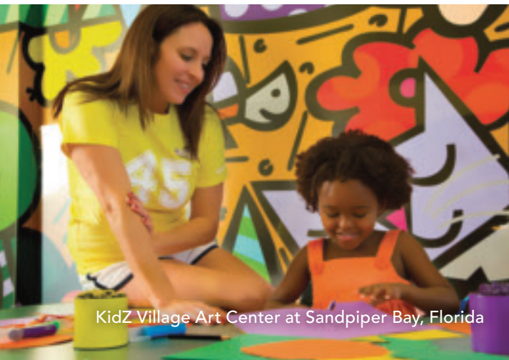
KidZ Village Art Center at Sandpiper Bay, Florida