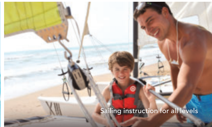
Sailing instruction for all levels