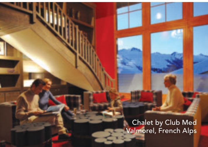
Chalet by Club Med Valmorel, French Alps

Having a wide range of room options ensures that each and every Club Med moment is a perfect one.