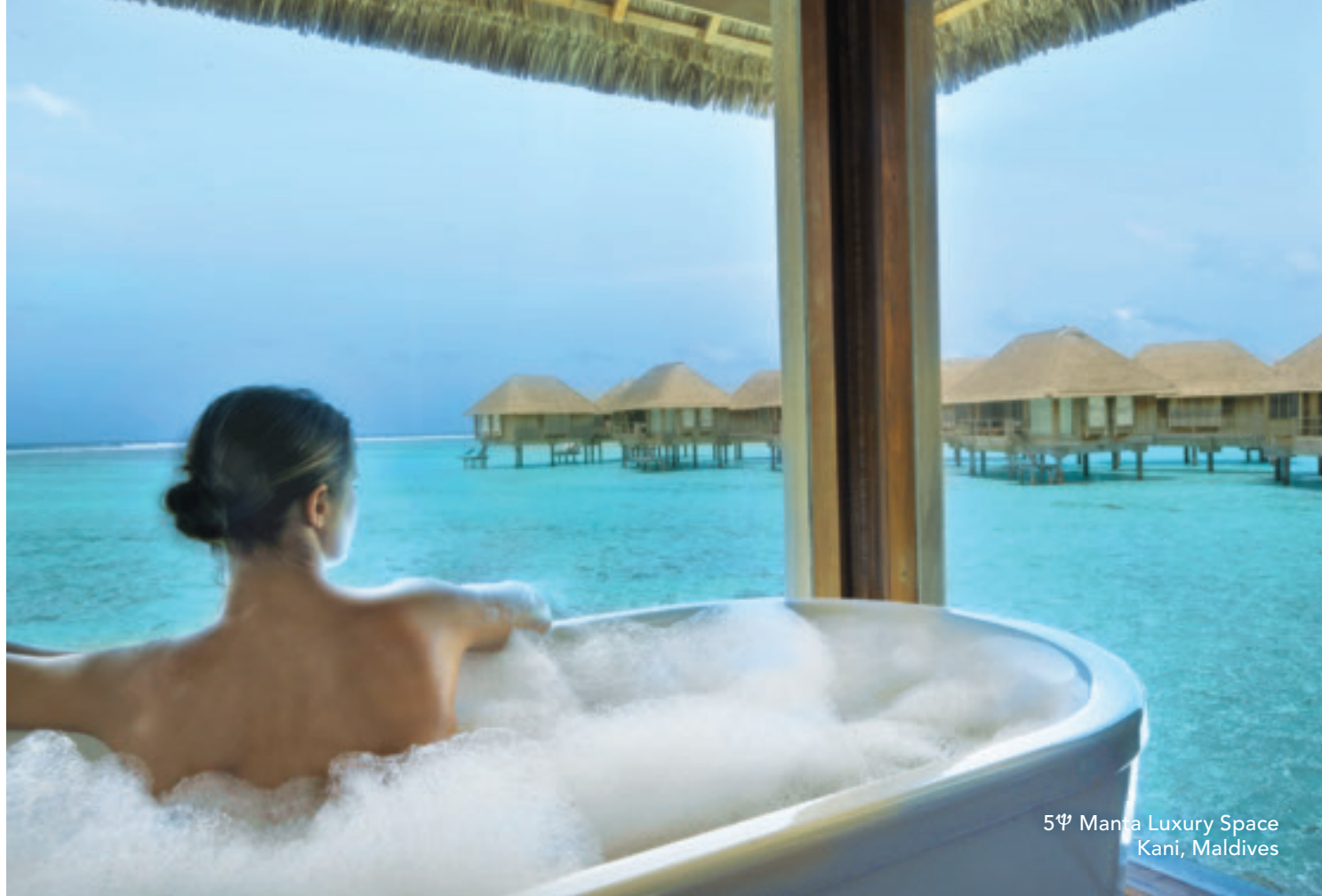
5Ψ Manta Luxury Space Kani, Maldives