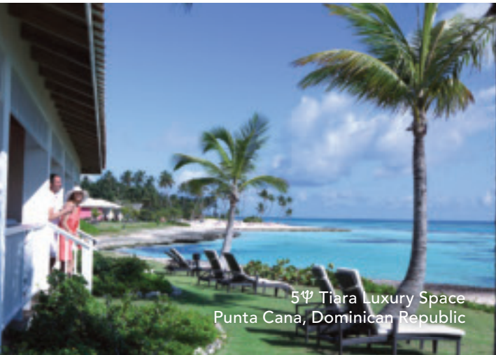
5 th Tiara Luxury Space Punta Cana, Dominican Republic

There are a wide array of elegant room categories, including the luxe Sol Suites at Ixtapa Pacific, Mexico, the Tiara Luxury Space at Punta Cana, Dominican Republic, and the elegant multi-story Alpine Chalets or sprawling Villas in Asia. In addition to having premium access to all the primary resort's offerings, these oversized accommodations boast luxurious appointments and offer exclusive amenities including bars, lounges, libraries, pools, and more. Special services are also offered, such as a private butler, personal chef, turndown service, and welcome gifts. The experience is completely tailored to you.