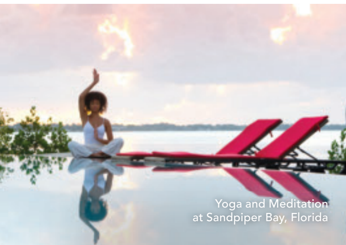
Yoga and Meditation at Sandpiper Bay, Florida

Well-being is an essential part of every Club Med stay. Along with special menu selections for healthy eating, there are fitness classes for every interest and full-service designer spas.