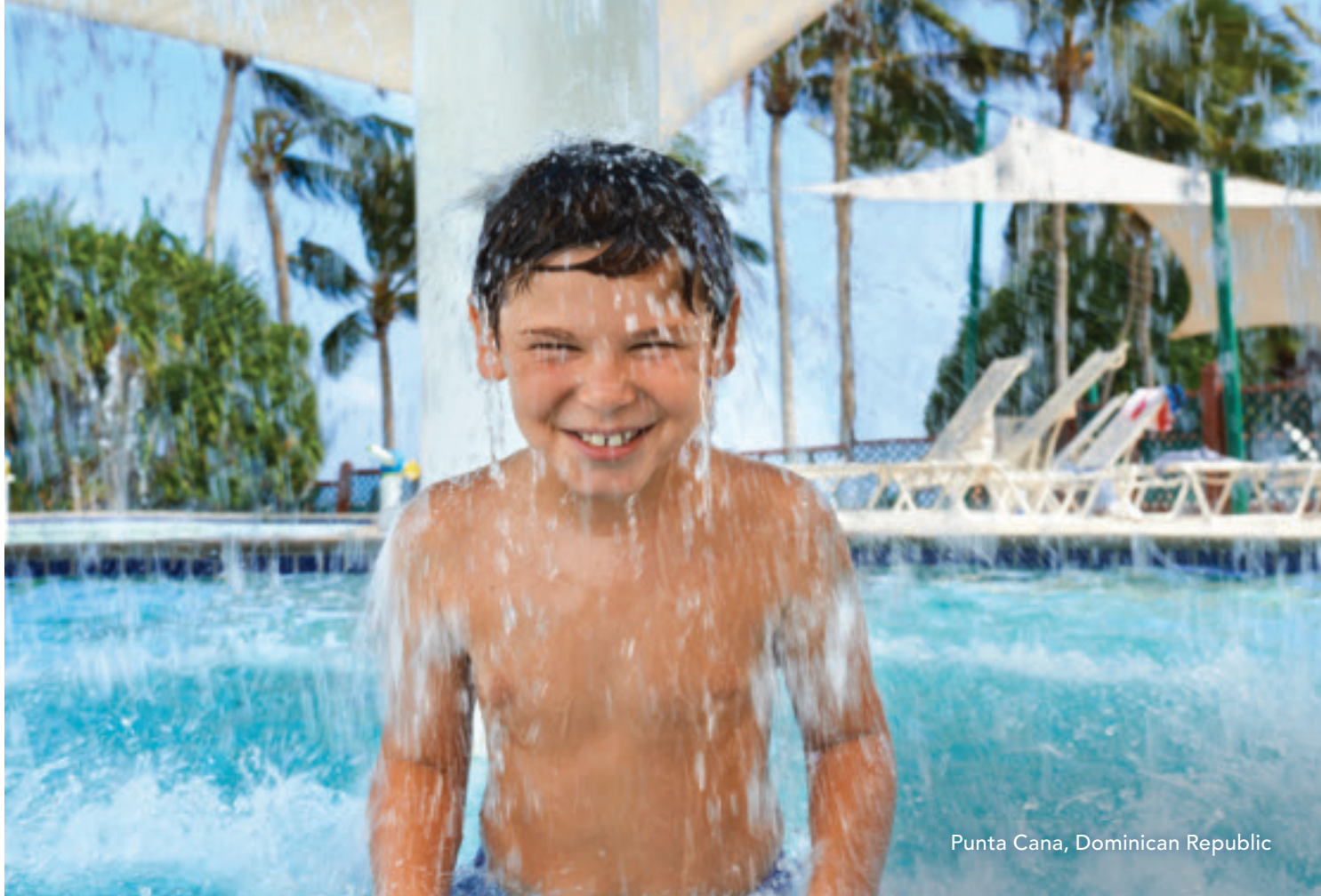
Punta Cana, Dominican Republic