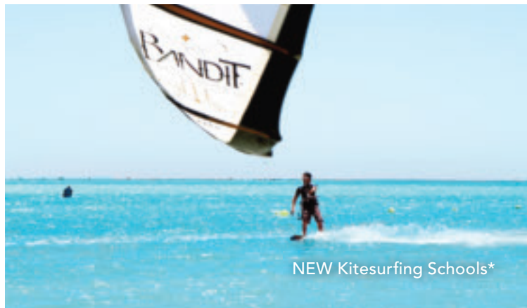
NEW Kitesurfing Schools*