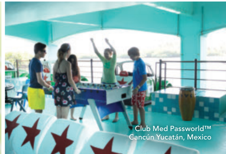
Club Med Passworld™ Cancún Yucatán, Mexico