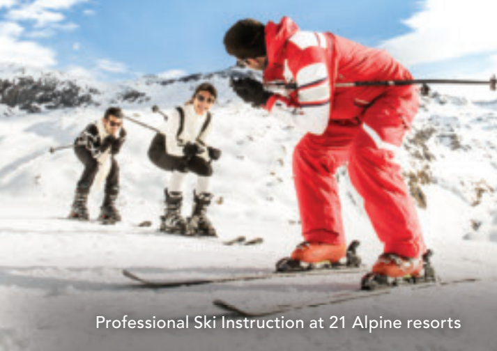
Professional Ski Instruction at 21 Alpine resorts