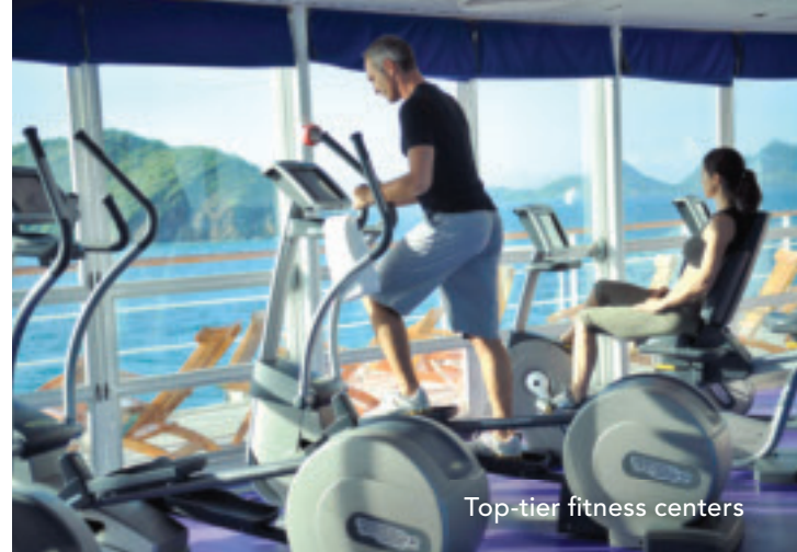
Top-tier fitness centers