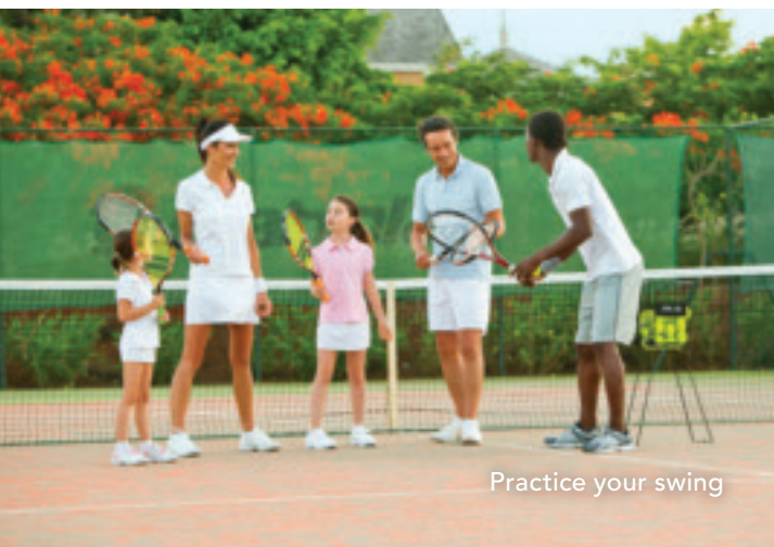
Practice your swing

Each includes top-of-the-line equipment and pro-coaching for all levels, from novice to seasoned pro.