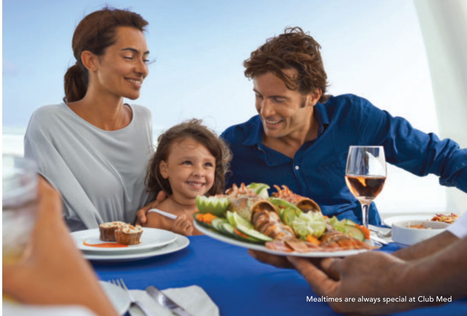
Mealtimes are always special at Club Med